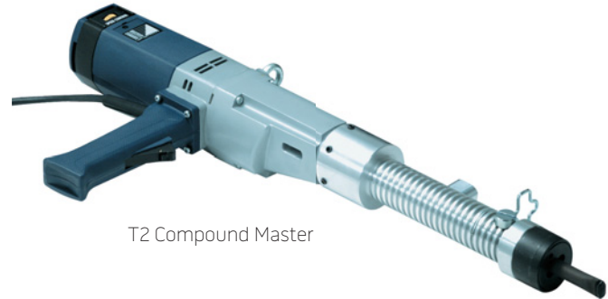
T2 Compound Master